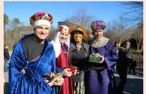
ARBOLITO: December 2017

Sponsorship of this event help support the event, gift giving, and helps raise funds to support operations.